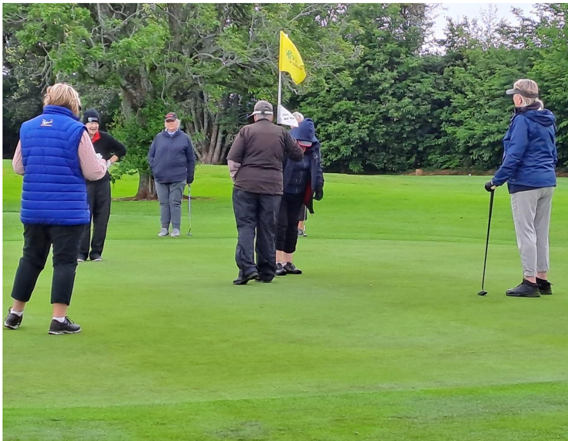
Figure 2 Putting out on the 8th