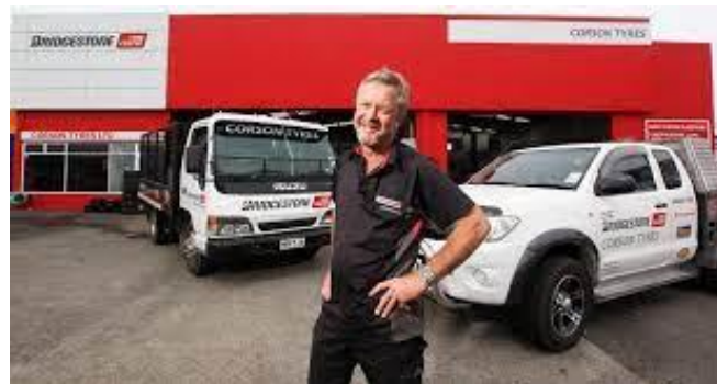
Figure 1: No this is not part of the Funnies