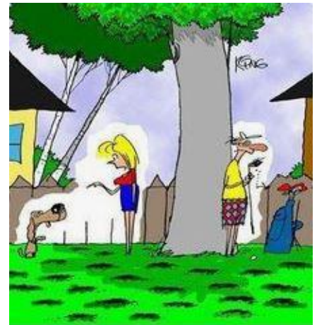
"Bad Dog! Dig up my lawn again and I'll have you neutered!"