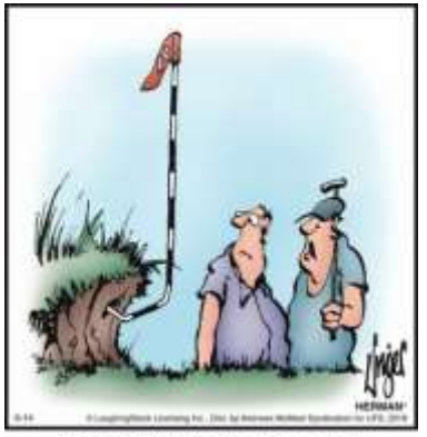
"I don't like the pin placement."

This week is mass a start and Green Keepers revenge so look out could be a bit of a laugh.