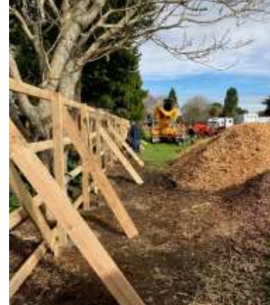
Figure 2: 7 July 23

Members will have noticed that, after several high-wind storms earlier this year, some sections of the very old 2.1m high fence between the Club's campground area and the neighbouring property collapsed. It has been clear for a few years that fence replacement was well overdue. Enquiries about claiming insurance proved unsuccessful, but we managed to negotiate with our neighbours that, if they funded all the materials required for a new fence along its full 45m length (timber, concrete, screws and nails), the Club would provide the labour to deconstruct the old fence and build the new one, also to a height of 2.1m. One of our builder members Ray Gadsby provided the materials quantity and cost estimates and sourced the materials, and also provided some key equipment items.