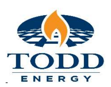
Figure 1: 7 July 23