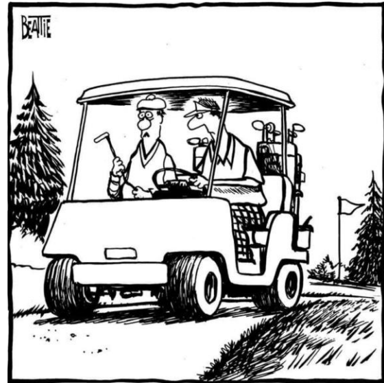
"I'm a two-handicapper trapped in a 30-handicapper's body."

Bad lies in a bunker is this week's tip. Any ball below the surface of the sand in a foot mark or plugged in soft sand, do not do what Jim Furyk did on the last hole of the US OPEN!!! He opened the face & shanked the ball into the front bunker & promptly lost the chance of the title!!! Instead, you turn the club face in, it is called either closing or hooding the face so that the face is looking to the left of the target. (right hander) With your 'V' swing described in article 15, you are able to get the leading edge into the sand sharply thus digging the ball out of an awkward lie. Always try to hit the sand 3-4" behind the ball with your "V" swing & the ball will pop out albeit with roll but you will get "the blighter out." Unlike dear old Jim!!!