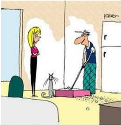
"I don't care if you do need practice hitting out of the sand. The cat needs her litter box!"